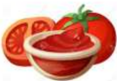
* tomato sauce