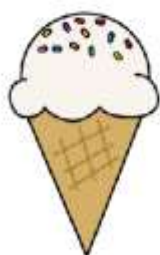
* ice cream