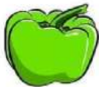
* green pepper